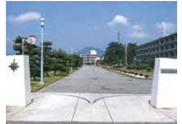
Japan Coast Guard Academy (JCGA, Hiroshima)