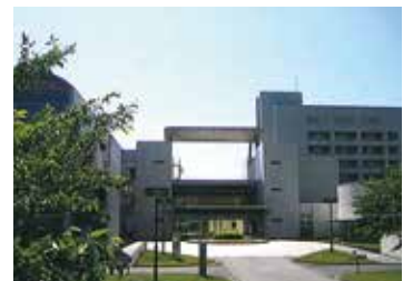
Chugoku Center, JICA (Hiroshima)

Photo Copyrights: Architectural Photos of GRIPS by Masao Nishikawa