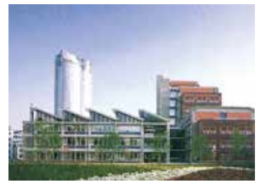
National Graduate Institute for Policy Studies (GRIPS, Tokyo)

3-3-1, Kagamiyama, Higashi Hiroshima-shi, Hiroshima