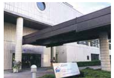
Tokyo Center, JICA (Tokyo)