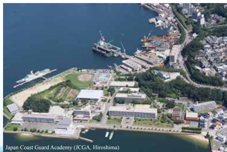
Japan Coast Guard Academy (JCGA, Hiroshima)