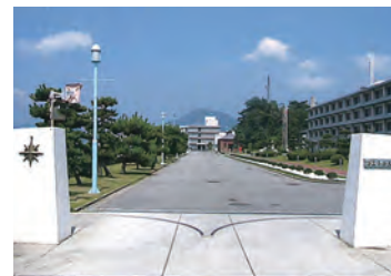
Japan Coast Guard Academy (JCGA, Hiroshima)