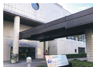
Tokyo Center, JICA (Tokyo)