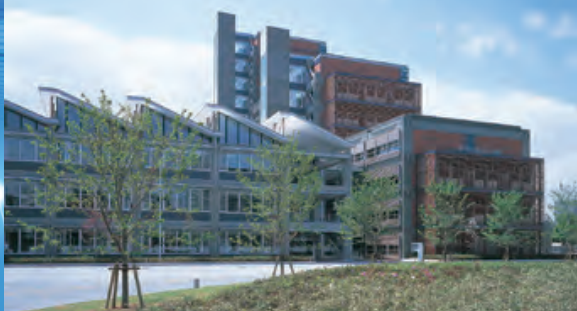
National Graduate Institute for Policy Studies (GRIPS, Tokyo)