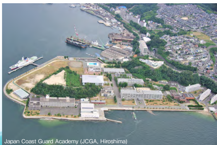
Japan Coast Guard Academy (JCGA, Hiroshima)