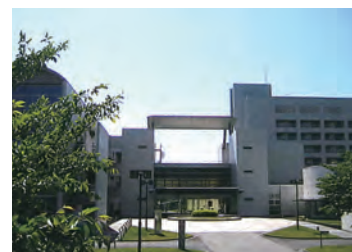
Chugoku Center, JICA (Hiroshima)

Photo Copyrights: Architectural Photos of GRIPS by Masao Nishikawa