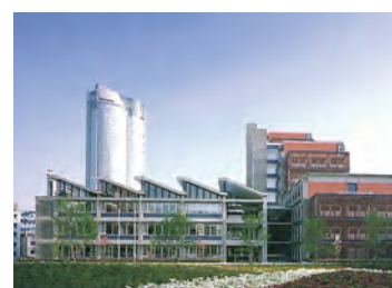
National Graduate Institute for Policy Studies (GRIPS, Tokyo)

3-3-1, Kagamiyama, Higashi Hiroshima-shi, Hiroshima