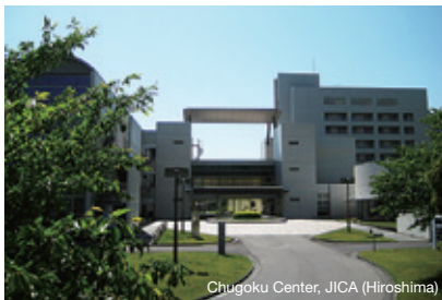
Chugoku Center, JICA (Hiroshima)

Photo Copyrights: Architectural Photos of GRIPS by Masao Nishikawa