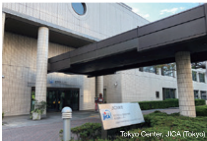
Tokyo Center, JICA (Tokyo)