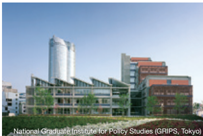
National Graduate Institute for Policy Studies (GRIPS, Tokyo)