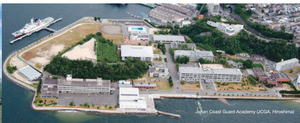
Japan Coast Guard Academy (JCGA, Hiroshima)