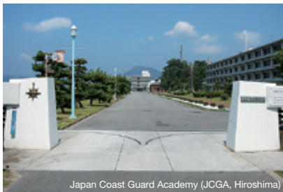
Japan Coast Guard Academy (JCGA, Hiroshima)