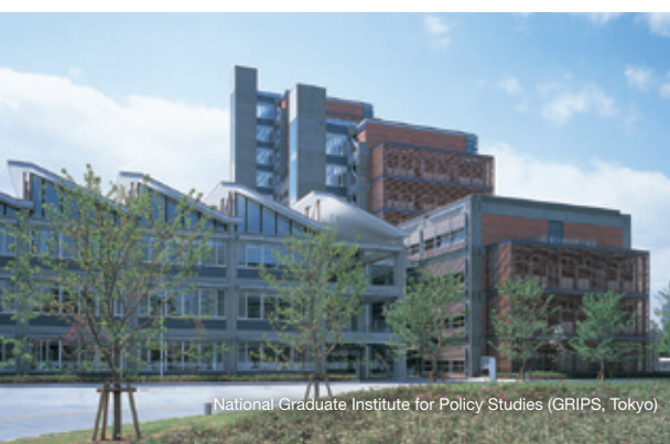
National Graduate Institute for Policy Studies (GRIPS, Tokyo)

By the end of the program, students will have acquired ability to formulate policy creatively and deal with maritime challenges effectively. And most important, they will have developed strong personal bonds that would enable them to work closely together to tackle issues and challenges that we are facing today and will face in the future.