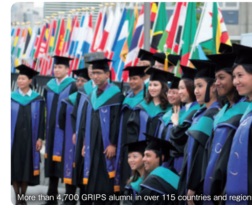
More than 4,700 GRIPS alumni in over 115 countries and regions