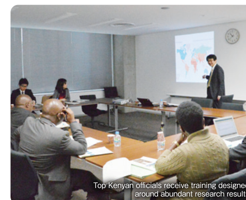
Top Kenyan officials receive training designed around abundant research results