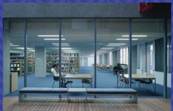
Campus Photographs by Masao Nishikawa